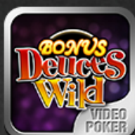
Bonus Deuces Wild