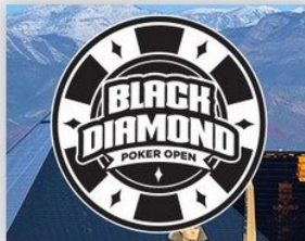
Black Diamond Poker Open 2021