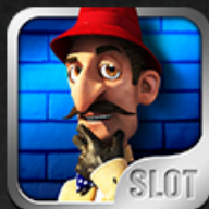
After Night Falls