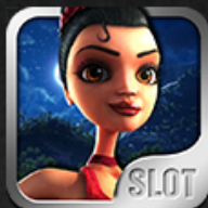
At The Copa