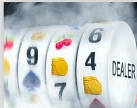
Jackpot Sit &amp; Go